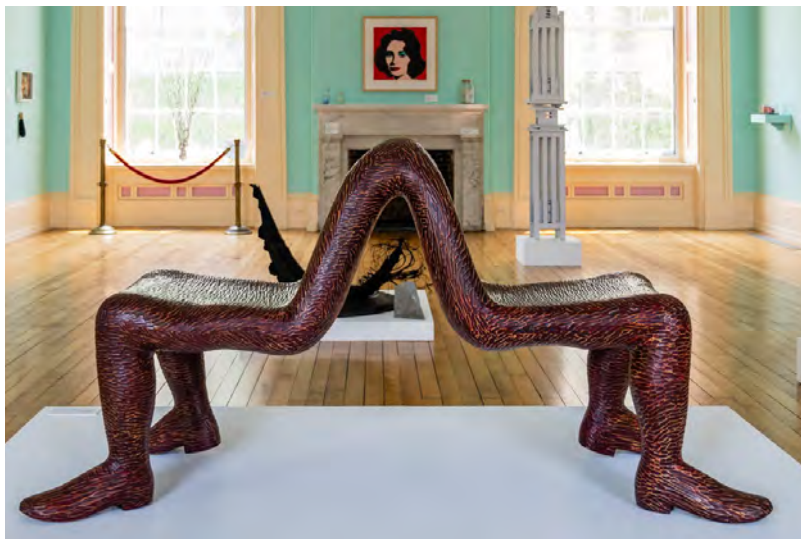
Wendell Castle, Handyman , Basswood, paint, 2004.