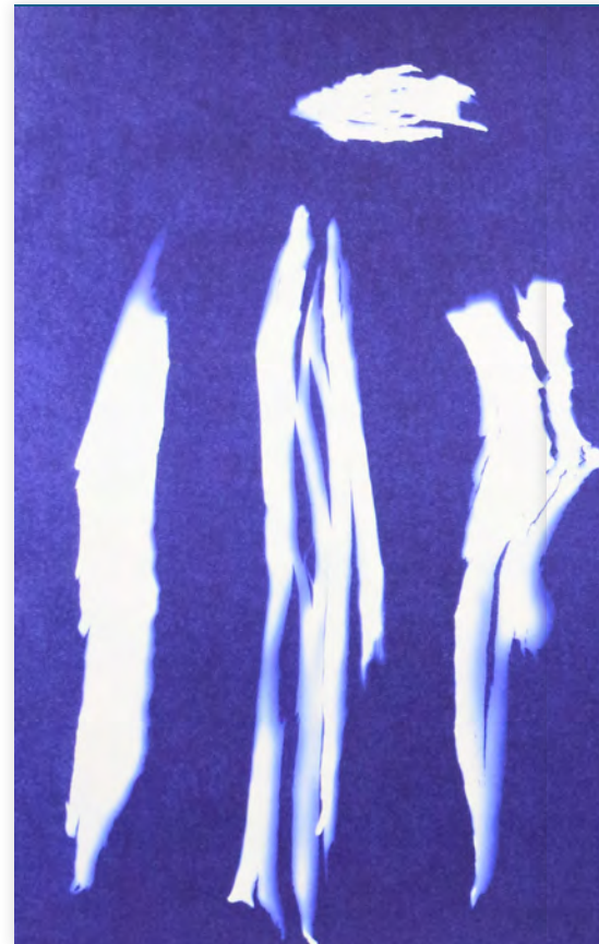
elin o'Hara Slavick, Eucalyptus Bark from an A-Bombed Tree , cyanotype. 2008. Family Tree .