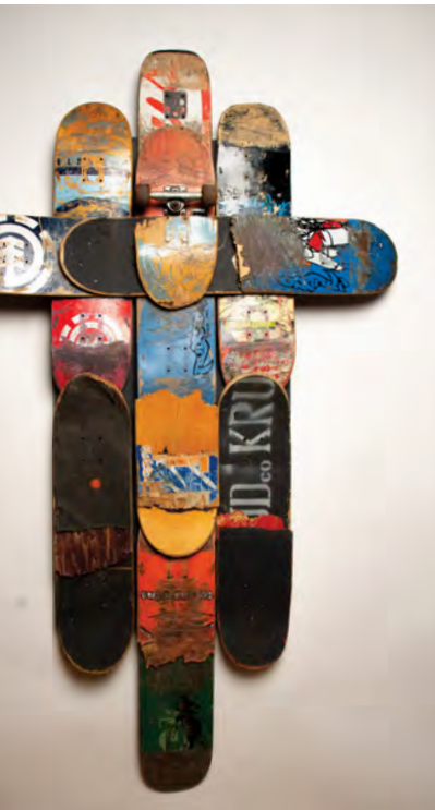
Tony Machi, INRI , wood, rubber wheels, paint, repurposed skateboard fragments, 2021. Passionately Curious .