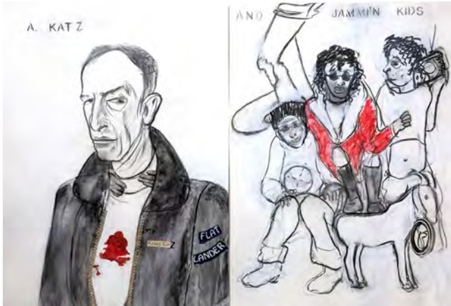
Amanda Kaiser, Untitled , charcoal, acrylic, pastel, and collage on paper. 1994. Selections from a Century .