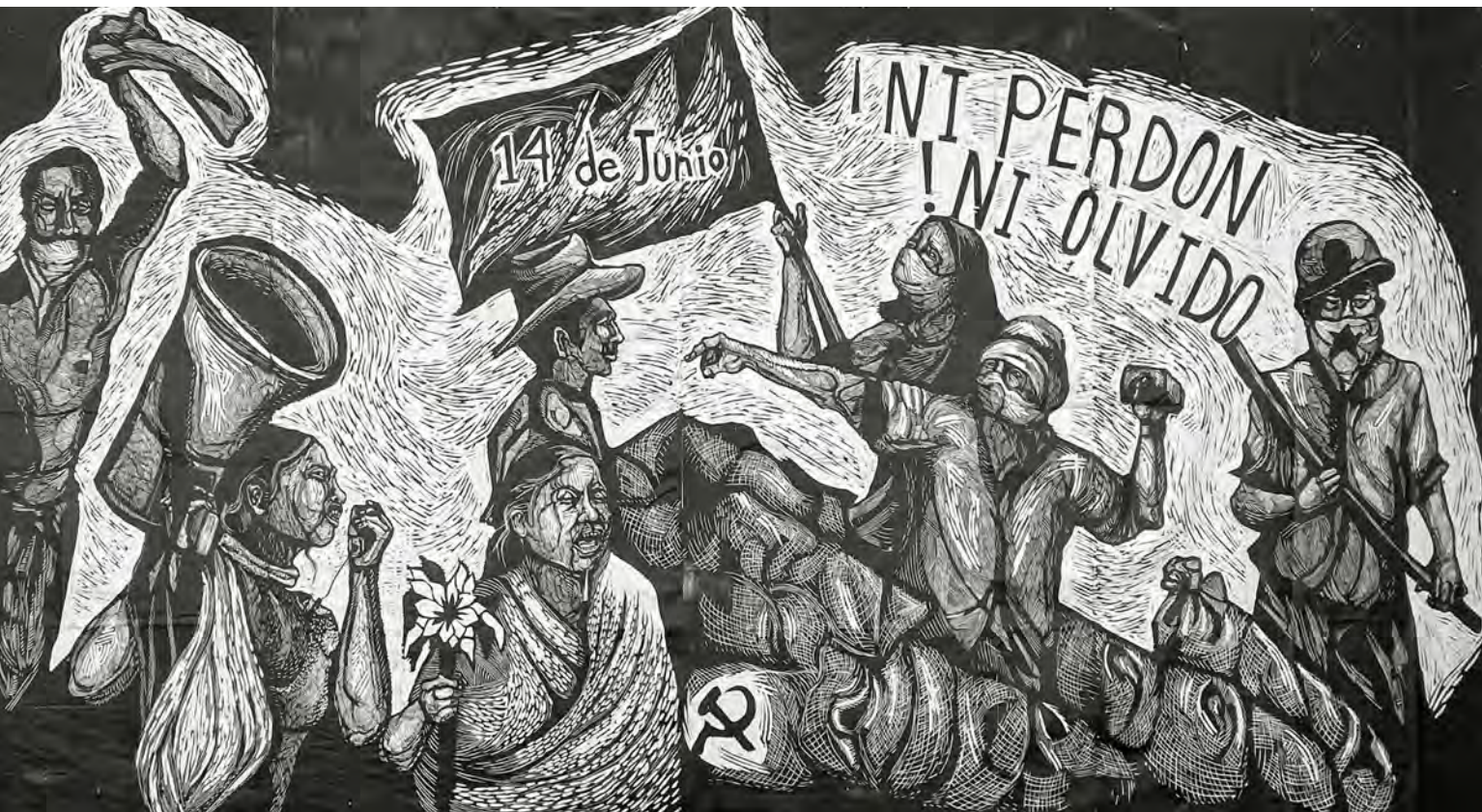
Subterráneos, 14 de Junio: ¡Ni Perdon, Ni Olvido! (June 14: Neither Forgive, Nor Forget!), 2022. 16'x8' linocut on newsprint.